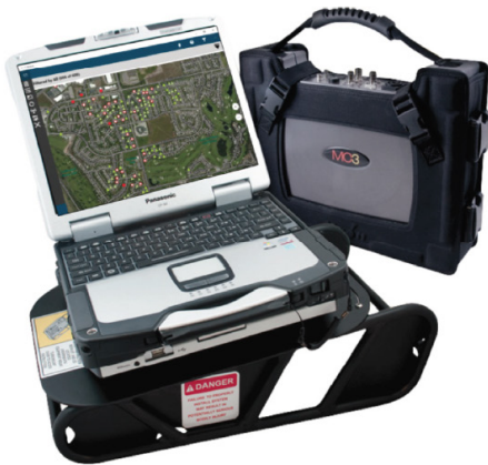
Itron MC3 Radio (actual size: 13" W x 11.25" L x 2.75" H)