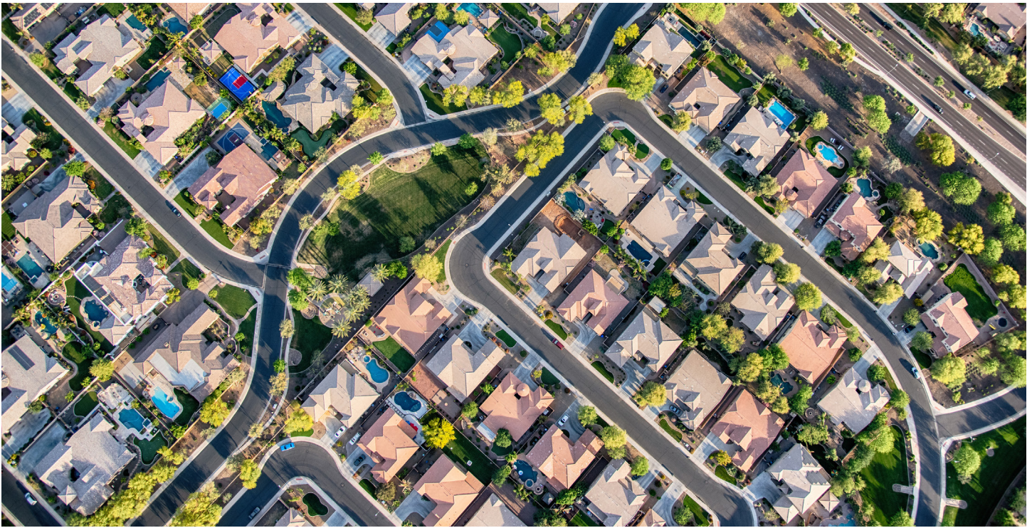
Temetra Mobile automates meter reading using drive-by or walk-by and Itron's advanced meters and endpoints.