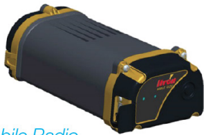
Itron Mobile Radio (actual size: 3.20" W x 5.66" L x 1.53" H)