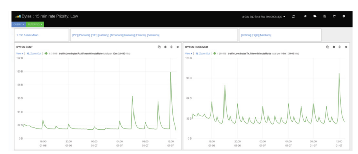
A query shows the number of bytes sent and received.