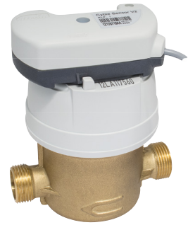
Water meter equipped with cyble sensor module