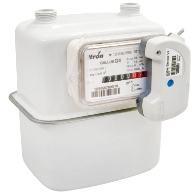
Gas meter equipped with cyble sensor module