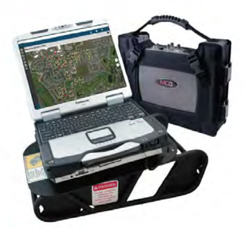
Itron MC3 Radio (actual size: 13" W x 11.25" L x 2.75" H)