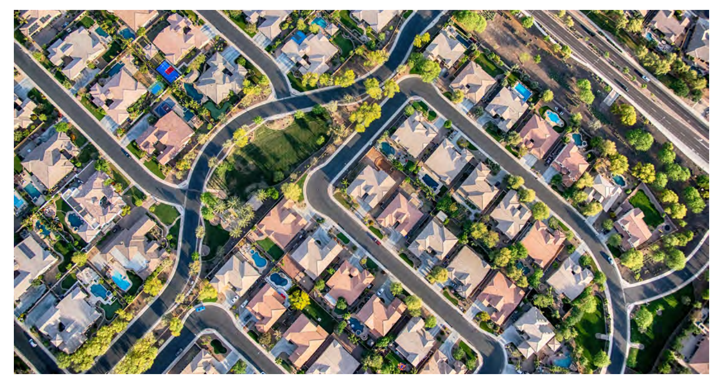
Temetra Mobile automates meter reading using drive-by or walk-by and Itron's advanced meters and endpoints.