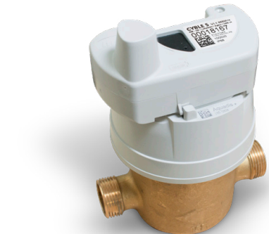
Aquadis+ equipped with the Cyble 5 module